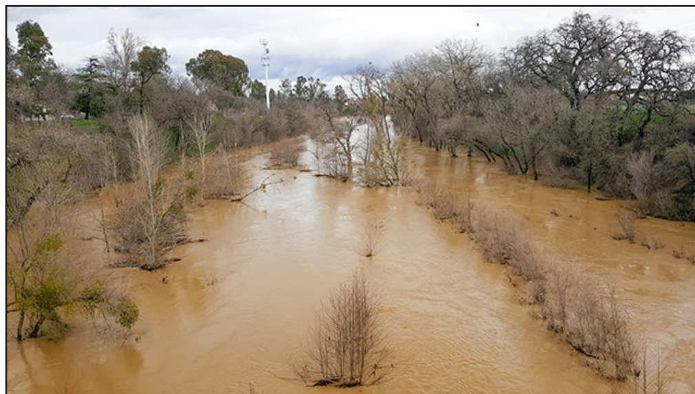
2-7-2017 Flood conditions.