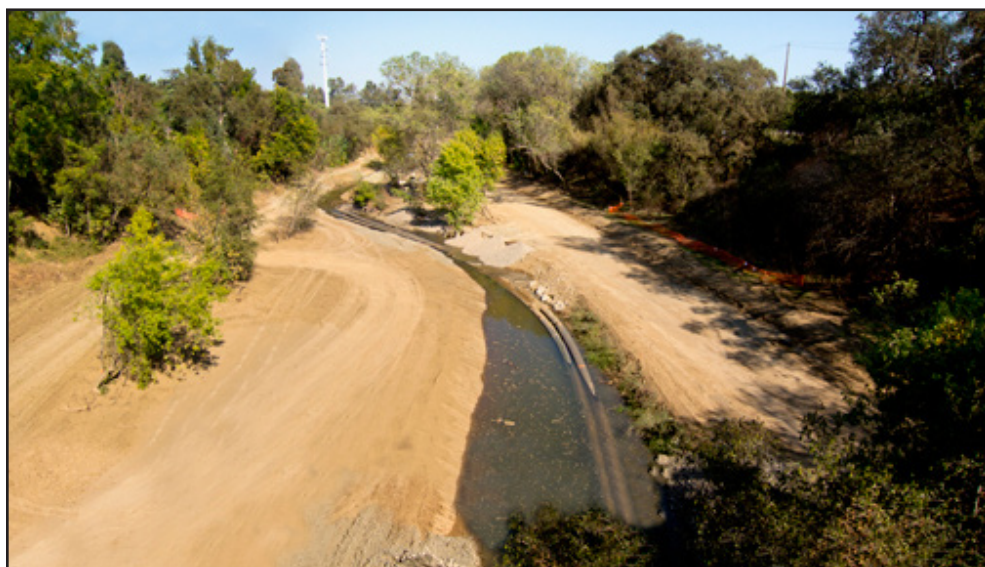
10/25/2011 Creekbed wetted