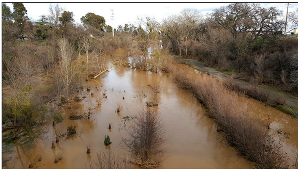
1-11-2017 Flood conditions. Note several avenues of free-flowing flood water.