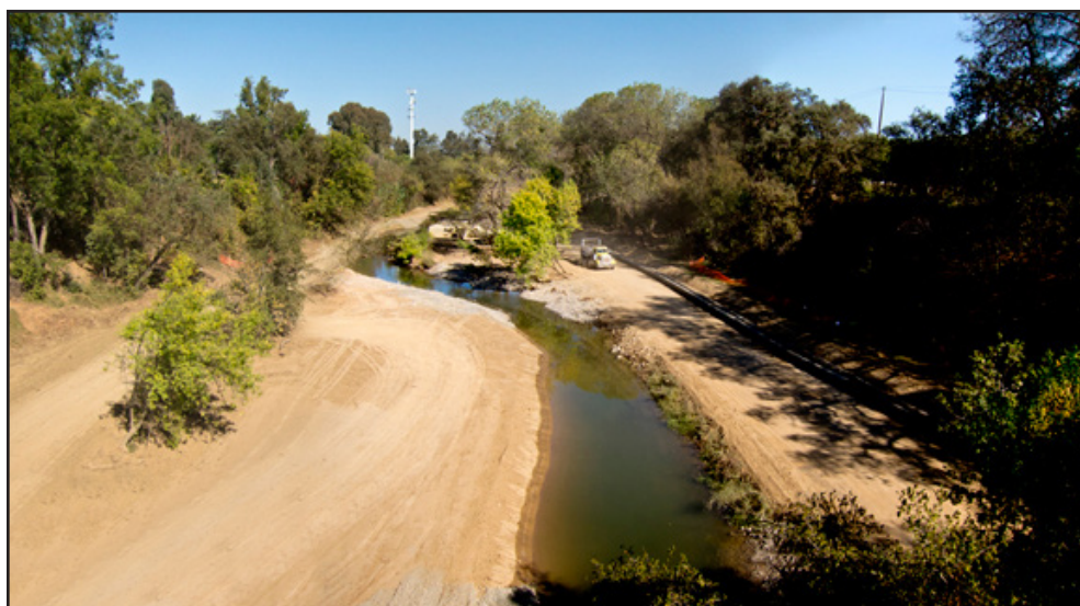
10/28/2011 Pipes Removed