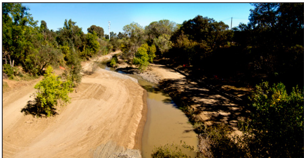
10/29/2011 Dam Removed