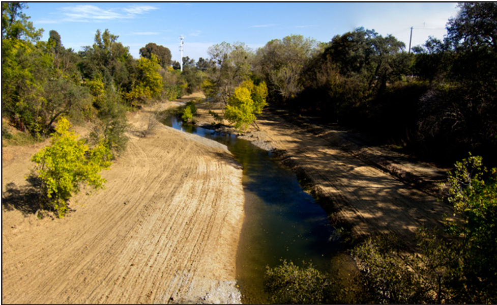
11/10/2011 Straw applied to banks.