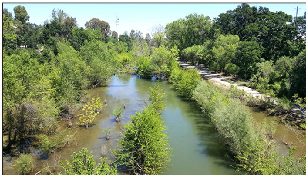
5-1-2017 After the significant floods in the spring of 2017.