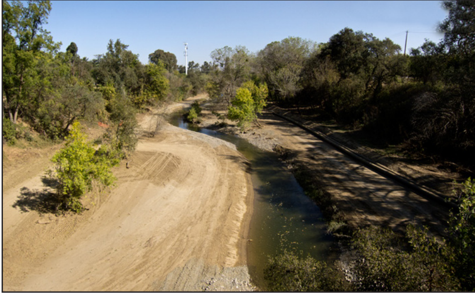
11/1/2011 Water Clear

Wildlife Survey & Photo Service 2443 Fair Oaks Blvd. # 209 • Sacramento, CA 95825 • (916) 747-8537